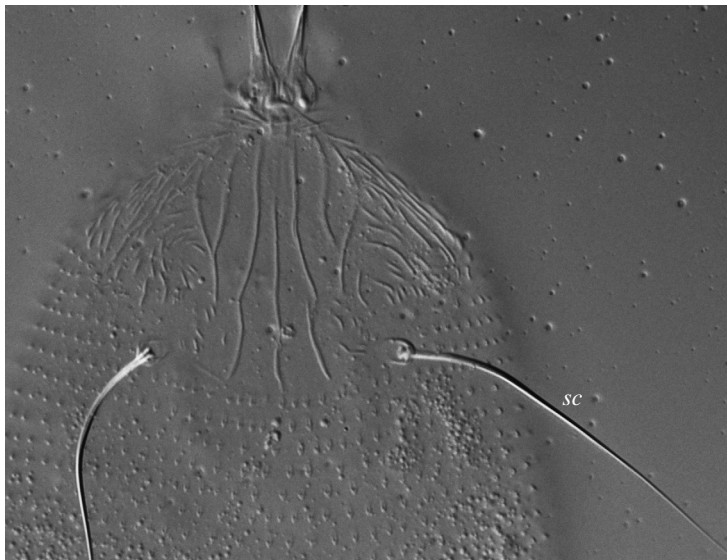
FIGURE 2. Photomicrograph (differential interference contrast microscopy at 1000x oil immersion, Nikon E-90 microscope with the imaging software NIS-Elements BR 3.10) of Aceria thalgi Knihinicki, 2009 collected in Auckland, New Zealand. Female adult in dorsal view showing the prodorsal shield pattern and arrangement of microtubercles on the dorsal annuli. Scale: the distance between the bases of two sc setae is 28 \mu\text{m} .

Voucher specimens. Collected by N.A. Martin on 20 Jan. 2010 from the rolled leaf edges of S. oleraceus in Mt Albert Research Centre, Auckland; mites mounted in Hoyers medium on 4 slides, with serial number 10-858 Z; deposited in the New Zealand Arthropod Collection, Auckland.