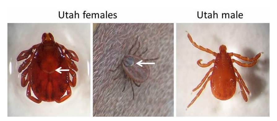
FIGURE 1. Scant gray ornamentation seen on Utah specimens of Dermacentor parumapertus.

Seventy-four adult D. parumapertus ticks (21F, 53M) were removed from 8 black-tailed jackrabbits in central Utah, while 13 adult D. parumapertus (7F, 6M) were found on 4 jackrabbits in western Texas. Three of the Utah rabbits had no ticks on them, while others were heavily parasitized. Ticks were primarily found in the ears and on the head. As for ornamentation, the Utah specimens were barely ornamented. Females displayed only slight gray ornamentation near the posterior edge of the scutum and small spots of whitish-gray distally on the femurs of legs II, III, and IV; males were completely devoid of any ornamentation (Fig. 1). The description of female D. parumapertus ornamentation in Arthur's monograph (Fig. 2) almost exactly matches the pattern we observed in the Utah samples (Arthur 1960). In contrast, Texas specimens were richly ornamented in white. Females were brightly marked with white (not gray) on the scutum very similar to D. variabilis (Fig. 3), and had white spots distally on all femurs. Males from Texas were variously ornamented along the posterolateral margins of the scutum and displayed white spots distally on all femurs.